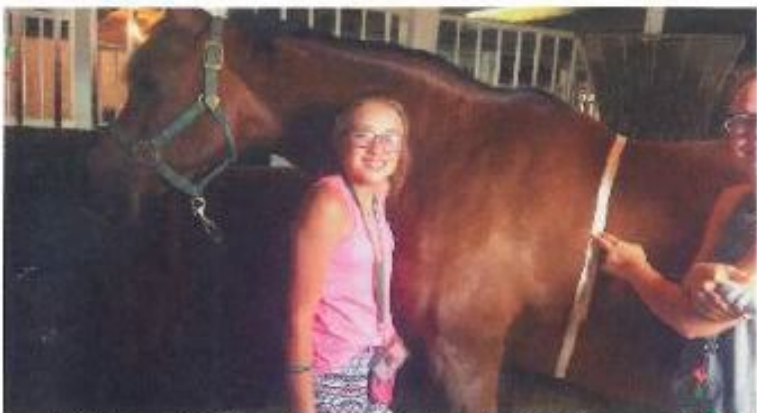
Michigan 4-H Horse Program develops leadership, responsibility, and communication skills in 7000 Michigan youth with the help of 1500 volunteers.