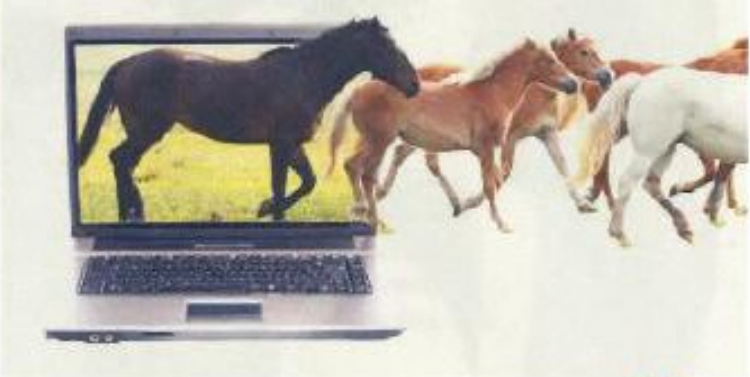
National online horse management program reaching over 500,000 horse enthusiasts MyHorseUniversity.com