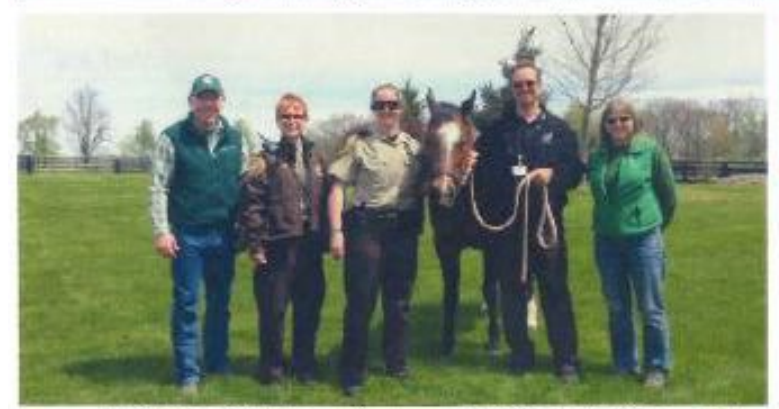
Educating Michigan animal control officers and first responders in horse handling and animal health ERAIL | canr.msu.edu/erail