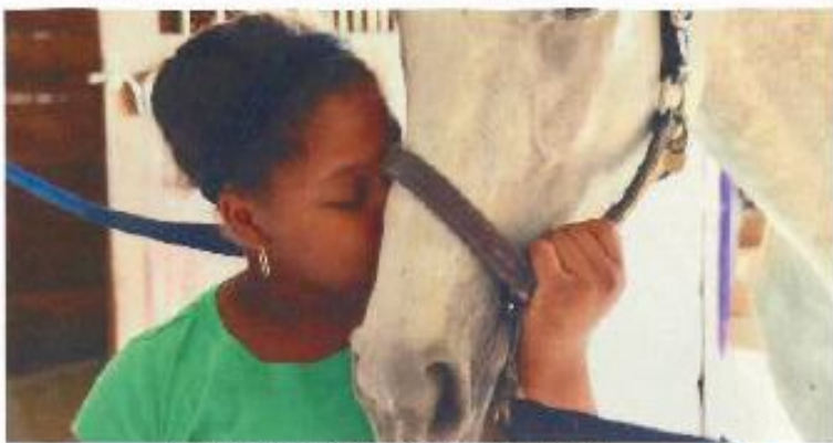
Collaborating with Detroit Horse Power Using the power of horses to expand appartunities for Detroit's children | DetroitHorsePower.org